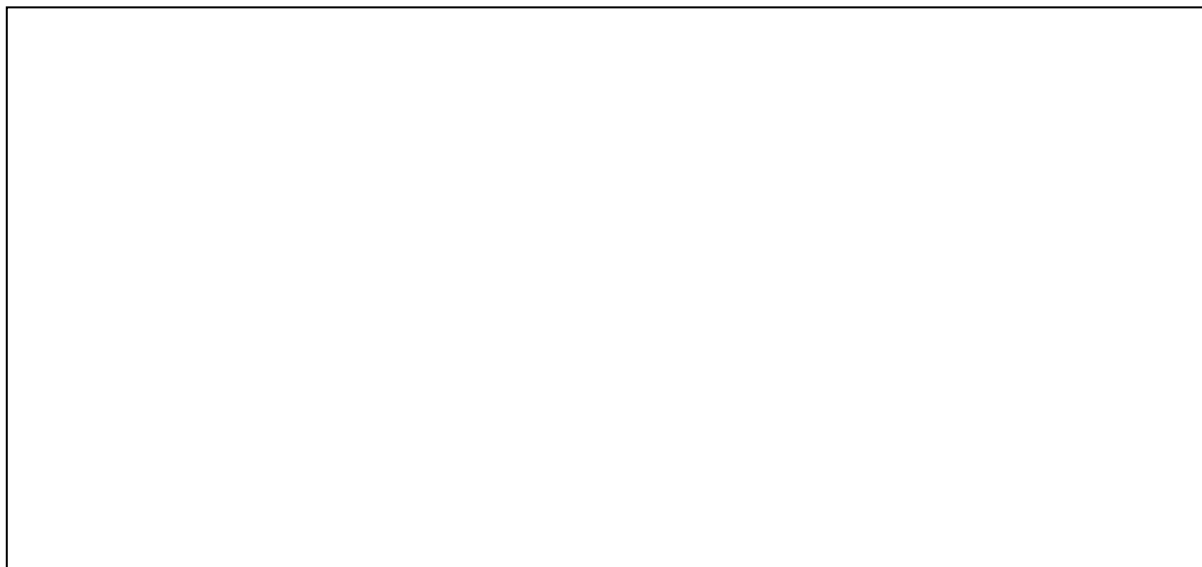
Figure 2. Example of a figure in two-column format. For two column format, the figure should be at either top or bottom of the page.